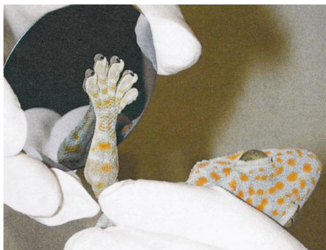
Fig. 2. Tokay gecko ( Gekko gekko ) adhering to molecularly smooth hydrophobic GaAs semiconductor. The strong adhesion between the hydrophobic surface of the gecko's toes and the hydrophobic GaAs surfaces demonstrates that the mechanism of adhesion in geckos is van der Waals force.

To account for the high degree of similarity in adhesive forces measured on surfaces with somewhat different polarizabilities, consider that when van der Waals interactions occur between